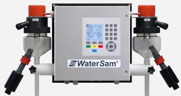
WS 98 with two FMWW sampling systems